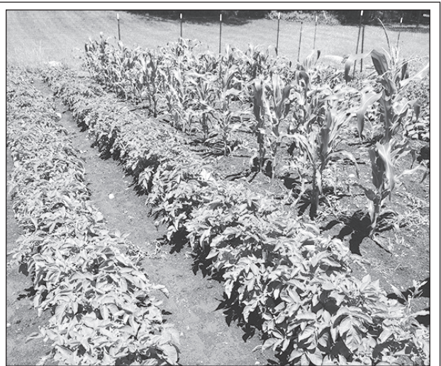
One way to reduce insect or animal pest numbers is to ensure ample space between plants.

Homeowners frequently enhance their outdoor living spaces with attractive plants and trees. When that greenery also produces food, the results can be both beauty and bounty. People who plant vegetable gardens and fruit trees in their yards can be blessed with an abundance of fresh pickings once it's time to harvest. In fact, many home gardeners may have visions of warm evenings pulling vegetables right out of the garden and tossing them on the grill or in salads. But insects and animals enjoy fresh produce just as people do. The joy of harvesting from a garden can be diminished when unwanted guests have gotten there first. Homeowners can employ these all-natural strategies to protect their fruits and vegetables from lawn pests and critters. Plant gardens in raised beds. Though they're not a fool-proof deterrent, raised beds can eliminate some garden infiltration by small critters that come up and under from the ground. A raised garden bed can deter rabbits, gophers, groundhogs, slugs and some other crawling pests. Raised beds also are ergonomic and easily accessible. Prepare homemade insecticide. The environmental