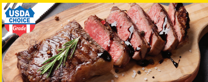
USDA Choice Family Pack New York Strip Loin

$1 98 Lb. Retail $2.48 Lb. Without Fresh Perks