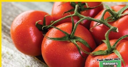
On The Vine Tomatoes