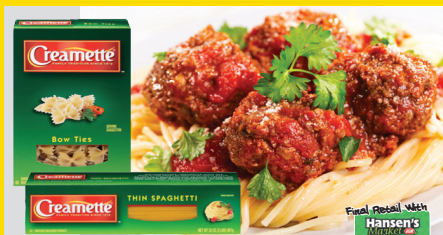
Creamette Pasta Selected Varieties 12-16 Oz.