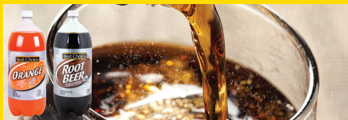
Best Choice Soda Selected Varieties 2 Liter With 75 Fresh Perks Points