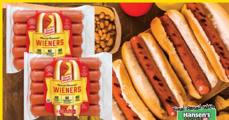
Oscar Mayer Hot Dogs Selected Varieties 16 Oz.

$8 98 Lb. Retail $9.98 Lb. Without Perks