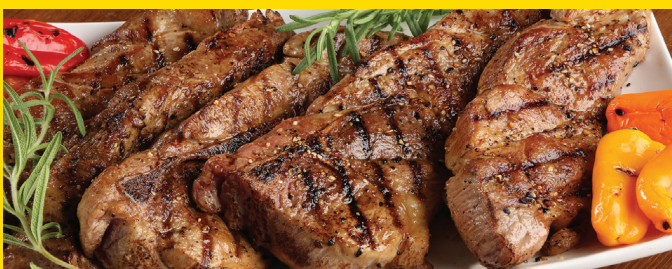
Mega or Family Pack Bone In Country Style Pork Ribs

$2 98 Lb. Retail $3.98 Lb. Without Fresh Perks