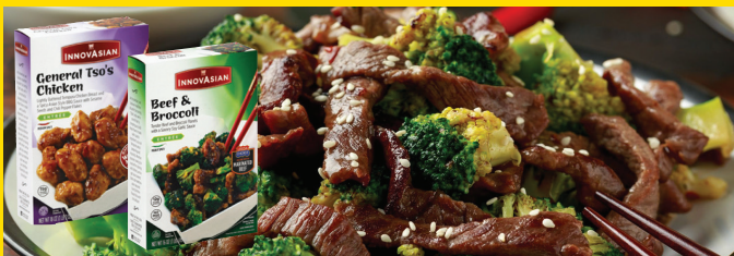
InnovAsian Entrées Selected Varieties 16-18 Oz. With 100 Fresh Perks Points