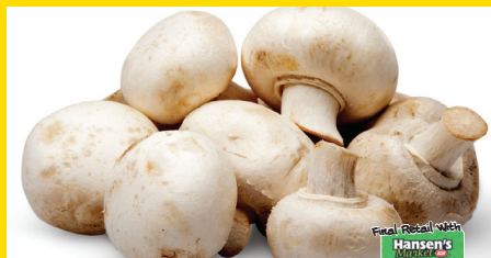
Whole White Mushrooms 8 Oz.