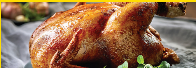
Deli Fresh Rotisserie Chicken With 100 Fresh Perks Points

$7 98 Ea. Retail $8.98 Ea. Without Fresh Perks