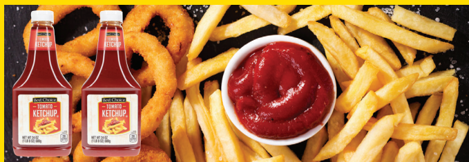
Best Choice Ketchup 24 Oz. With 75 Fresh Perks Points

$7 98 Ea. Retail $8.98 Ea. Without Fresh Perks