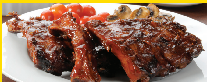
Pork Loin Baby Back Ribs

PRICES EFFECTIVE: MONDAY - SUNDAY, MAY 15 - MAY 21, 2023