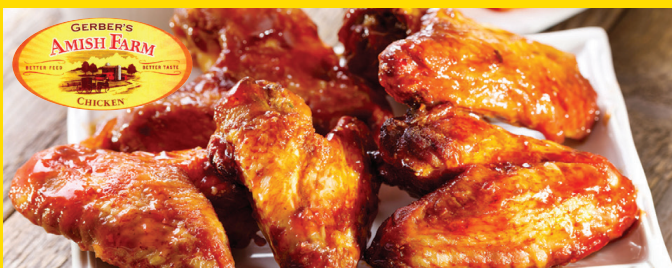
Family Pack Gerber Farms Chicken Wings

$11 98 Lb. Retail $12.98 Lb. Without Fresh Perks