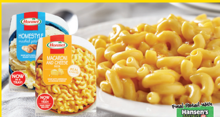
Hormel Side Dishes Selected Varieties 19-20 Oz.